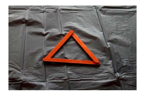
Step 2: Glue the ends of each Popsicle stick together, securing the three points of your triangle, and allow time to dry.

Step 1: Arrange three popsicle sticks (or six for a larger wheel, two to a side) into a triangle. Then using take or hot glue, secure all triangle points together.