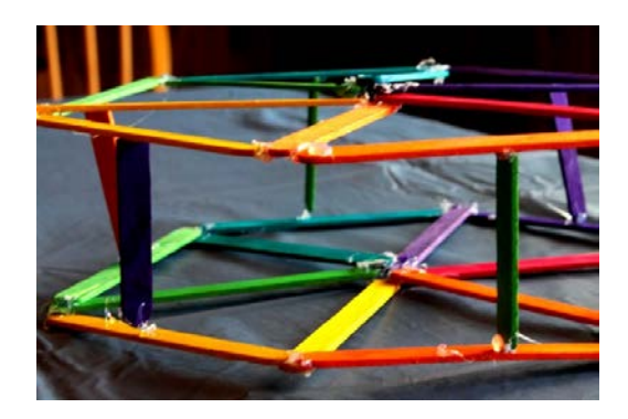
Step 5: Construct two large triangles for the base. Use at least one more stick per triangle side than you used for your wheels. Allow one corner of these triangles to meet further down from the tip of the Popsicle sticks, creating an "X" at the top.

Step 4: Break Popsicle sticks in half and attach them to the two wheels as cross bars. You will need to break half the number of Popsicle sticks as you have sides to your wheels as these sticks are to be spaced evenly in the same intervals as your triangles. For example, if your wheels have six sides, you will need three Popsicle sticks for this step.